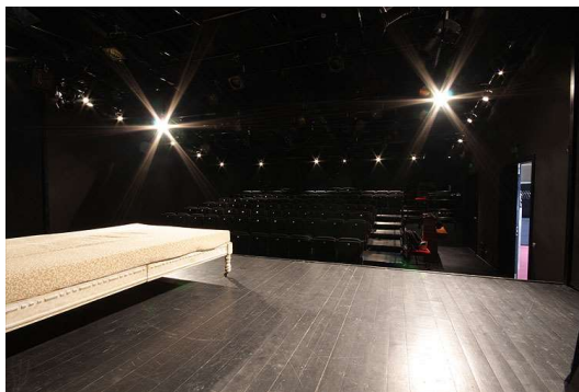
The Small Stage (Height: 4 m, width: 9,9 m, depth: 5 m)