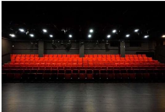
Rūta's Hall (Height: 4 m, width: 19,8 m, depth: 7,3 m)

4.6 Projected venue for implementation * ( More information about NKDT stages at https://dramosteatras.lt/en/theatre/stages/ )